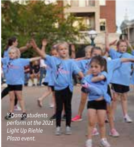
Y-Dance students perform at the 2021 Light Up Riehle Plaza event.

YWCA Y-Dance gives dancers of all ages and abilities the opportunity to explore dance and enhance coordination and creativity. At the 2021 Spring Recital, YWCA Y-Dance sold 597 tickets to fill the historic Long Center for the Performing Arts, showcased 169 individual dancers on the stage, and engaged 88 volunteers.