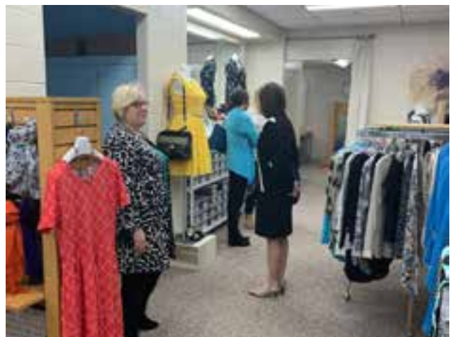
Dress for Success Greater Lafayette Boutique